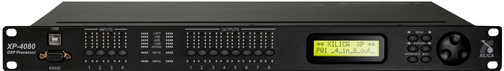
(XP-4080 Model Shown)