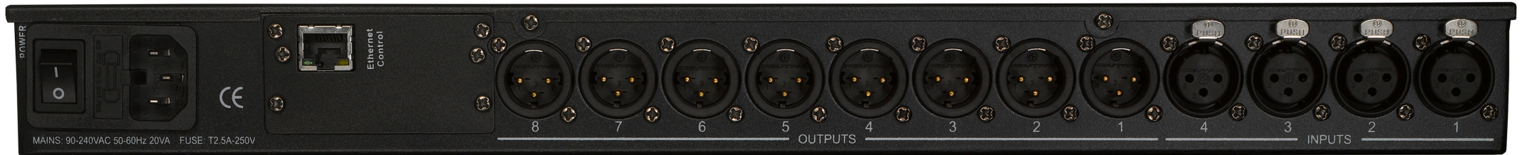
(XP-4080 Model Shown)